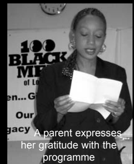
A parent expresses her gratitude with the programme

For further information on any of the programmes please email: themecanbe@100bmol.org.uk