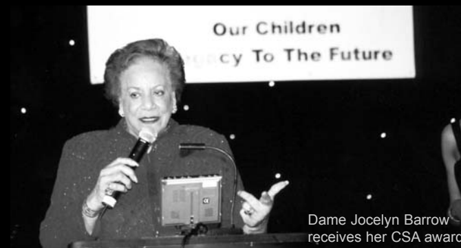
Dame Jocelyn Barrow receives her CSA award

surprised at being the recipient of the Mentee of the Year was one of the most memorable moments of the evening.