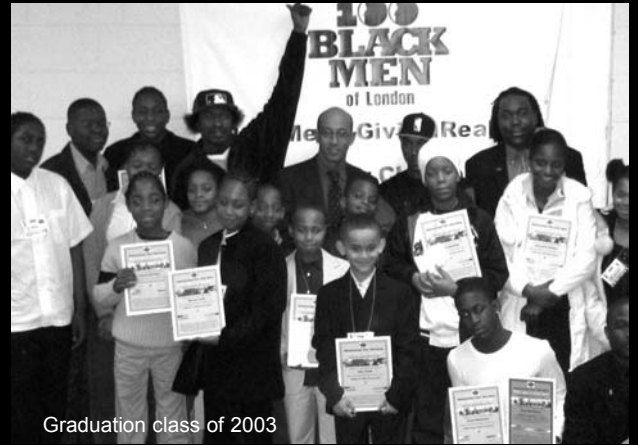
Graduation class of 2003