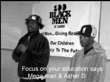
Focus on your education says Mega man & Asher D